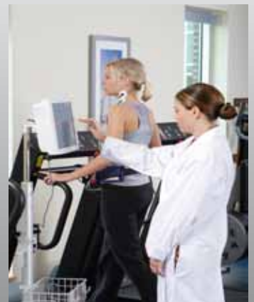
Routine hemodynamic evaluations