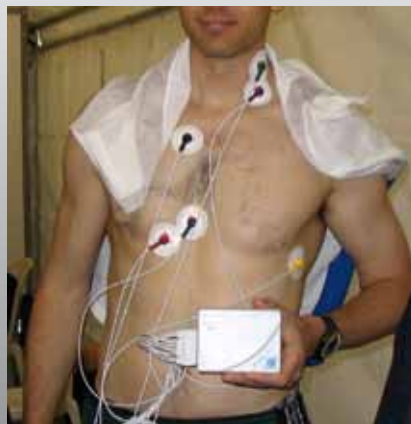
Paris Marathon field experiments