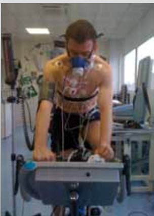
Assessment of performance limiting factors